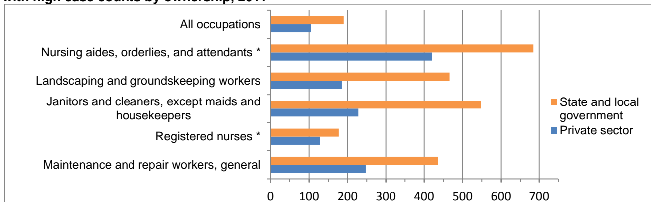
Chart A. Incidence rates of injuries and illnesses with days away from work for selected occupations 1 with high case counts by ownership, 2011

The incidence rate for public sector workers was 190 cases per 10,000 full-time workers (compared to a rate of 105 for private industry). Some occupations experienced higher rates in the public sector (state and local government combined) than their counterparts in the private sector. Janitors and cleaners and landscaping and groundskeeping workers had a public sector rate that was over twice that of the private sector. (See chart A.)